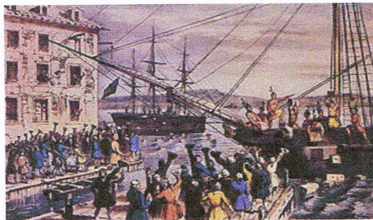
The Boston Tea Party by Nathaniel Currier

Not really. There was tea involved, but nobody was drinking it. The Boston Tea Party was a protest by the American Colonists against the British government. They staged the protest by boarding three trade ships in Boston Harbor and throwing the ships' cargo of tea overboard into the ocean. They threw 342 chests of tea into the water. Some of the colonists were disguised as Mohawk Indians, but the costumes didn't fool anyone. The British knew who had destroyed the tea.