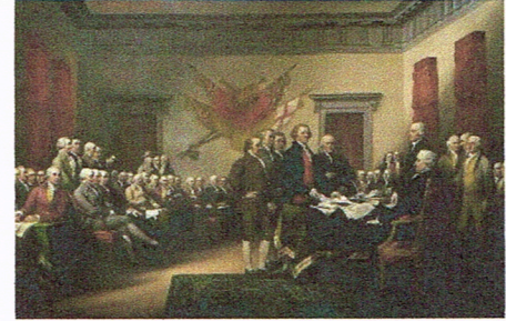
Declaration of Independence by John Trumbull

On June 11, 1776 the Continental Congress appointed five leaders, called the Committee of Five, to write a document explaining why they were declaring their independence. The five members were Benjamin Franklin , John Adams , Robert Livingston, Roger Sherman, and Thomas Jefferson . The members decided that Thomas Jefferson should write the first draft.