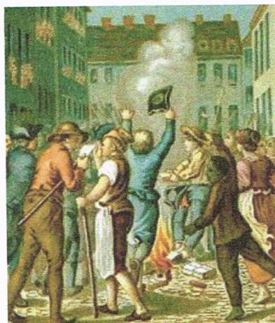
People Burning the Stamped Paper by Unknown

It was during this time that groups of American patriots called the Sons of Liberty began to form. They took the protests of British taxes to the streets. They used intimidation to get tax collectors to resign from their jobs. The Sons of Liberty would play an important role later during the American Revolution.