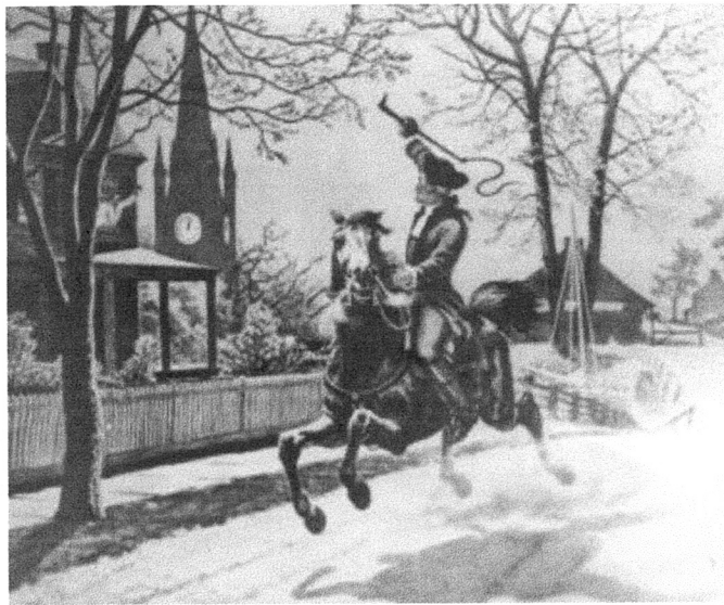
Paul Revere's Midnight Ride